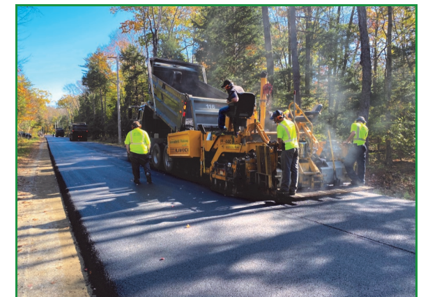
Our highway team at work. Summer hours for the Town Highway Department are 6 a.m.-4:30 p.m. Monday—Thursday.

Greenfield's road system includes town, county and state roads (see right). To report trees and other objects that are obstructing our town roads or to report missing road signs call us at 518-893-7604. We can also provide contacts at the state and county level.