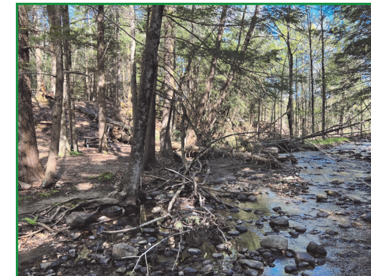
A peaceful scene to enjoy at Porter Corners Park.

#2 Porter Corners Dog Park: At the same location, if you are looking for some extra time with your pooch, one of the former baseball fields has been converted to a fenced in dog park, where your dog can spend