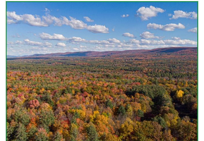
Enjoy your fall in beautiful Greenfield at one of our many town parks or our New York State DEC Forests.

Middle Grove State Forest: 573 acres and parking at Barney Rd., Clark Rd., Young Rd. and several lots off Middle Grove Rd.