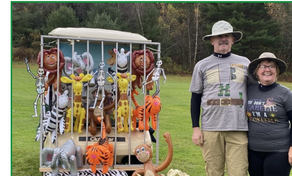
Our creative residents really make this event fun, sharing candy from themed golf carts, which can be reserved by calling 518-428-2267.

Hundreds of Greenfield families and their friends join us for this chance to trick-or-treat on our beautiful Brookhaven Golf Course. Dozens of themed golf carts — set up by our creative residents, local businesses and community leaders —