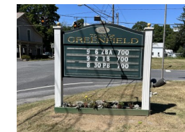
This current Town Hall sign will soon get a whole new look!

The Town is paying for the sign with funds provided by the American Rescue Plan Act.