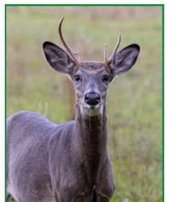
Don't forget to stop by the Town Clerk's office for your hunting permit.

Applicants must bring a driver's license for proof of residency, as well as a previous license or training certificate for proof of eligibility. The conservation year runs from Sept. 1-August 31. The Deer Management Permit (DMP) deadline is Oct. 1. Those with a DMP may take one antlerless deer. Lifetime licenses are also available.