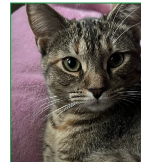
Keep your pets inside, particularly this time of year.

Keep in mind that New York State requires your dog to be licensed, and your dog's tags can help us return them to their owner quicker. Learn more about licensing your dog at greenfieldny.org .