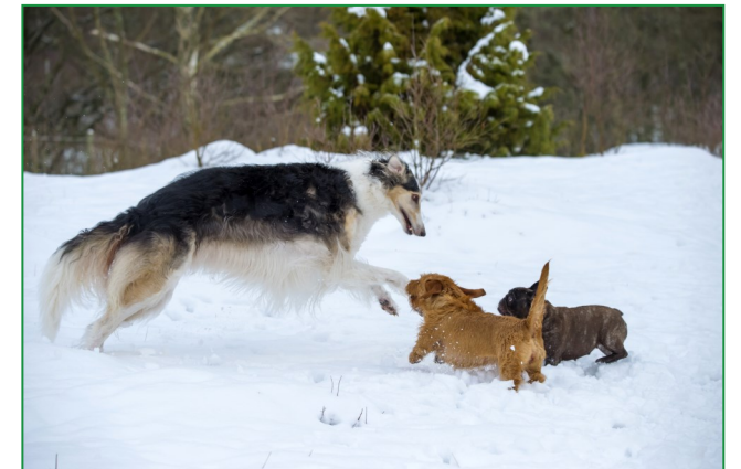
The Greenfield Dog Park, One Line Drive in Porter Corners is open beginning Feb. 14. All guests must register at Town Hall.

Dog owners are thrilled to hear our dog park in Porter Corners is reopening Feb. 14. The park closed in early December after an incident involving off-leash dogs. The town has been working on making safety improvements and a new registration process to protect both visitors and neighbors of the park.