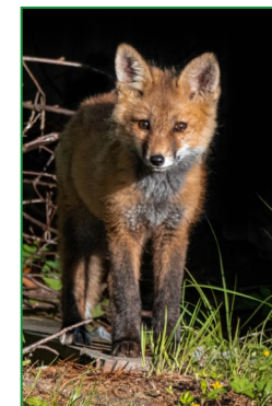
Foxes, coyotes and fishers all are searching for food this time of year. The DEC warns us to keep your pets inside when possible.