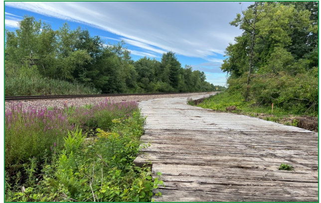
The clearing of land adjacent to the train tracks is to make room for the CHPE power line.

CHPE has asked for permission from each and every town and private land owner involved. In Greenfield, CHPE entered agreements with landowners to use two private parcels, securing permanent and temporary easements by mutual agreement in March of 2023. If you have not been contacted by CHPE, the