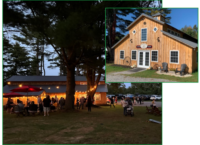
This TOG social hour will take place Sept. 28 from 5-8 p.m. at Fossil Stone Vineyards at 331 Grange Rd.

Consider joining us at the next TOG social hour at Fossil Stone Vineyard & Winery on Sept. 28 from 5 to 8 p.m. Food trucks will be onsite for dining. Enjoy a TOG Fall Sangria special and corn hole. Beer, wine, hard seltzers and nonalcoholic drinks will be sold. Fossil Stone opened in September of 2023 and recently has been holding events at its beautiful 140-acre farm and vineyard location and rustic tasting house. The address is 331 Grange Rd. No sign up required! See you there.