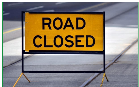
All road closures are announced on the town's Facebook page.