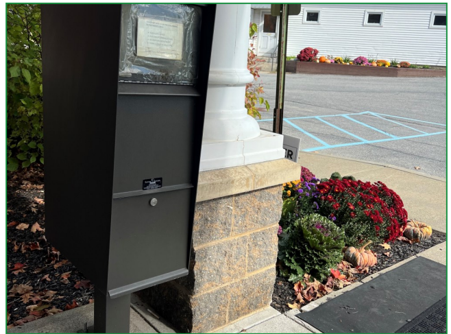
Can't make it to Town Hall during our business hours? Use this drop box out front.

The green box (left, above) is for Town Court payments or paperwork after hours.