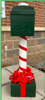
Santa's mailbox will be in front of Town Hall until Dec.15.