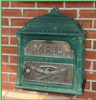
This mailbox is for Greenfield Court related after hours drop off.

Follow townofgreenfieldny on Facebook and Instagram www.greenfieldny.org